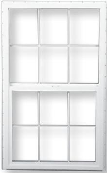
Single hung windows offer the best of both worlds – classic beauty and modern practicality.

Whatever your home's architectural style, 70 Series single hung windows will convey impeccable quality and taste. Built for everyday wear and tear, our single hung windows feature a heavy-duty construction that will stand the test of time.