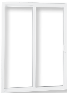
An integral full-length interlock provides increased strength and protection from energy loss.