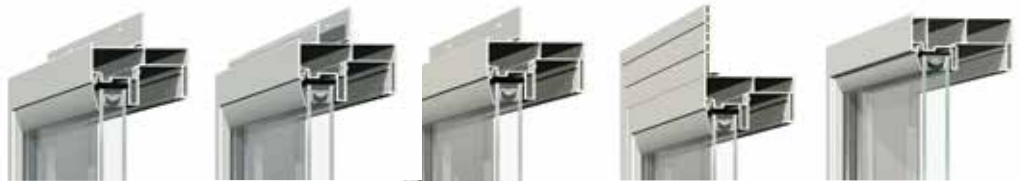
1-3/8" Nail Fin (standard)

70 Series windows are available with a variety of glass options. Your Gentek Sales Representative can help you choose the ideal glass package to meet the ENERGY STAR® requirements for your home and climate zone.