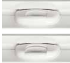
Optional self-locking Positive Action Lock (PAL) shown unlocked and locked. Window unit closes and automatically locks in one action.